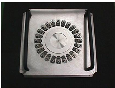
New MT 24-axis Holder

Description: _____ Rubber & Glass Pads Available for various Hardness & Thickness ( ask for details ): 60, 65, 70, 75, 80, 85 & 90 durometer 4.8, 4.9, 5.0, & 5.05 mm thickness All for 5" diameter